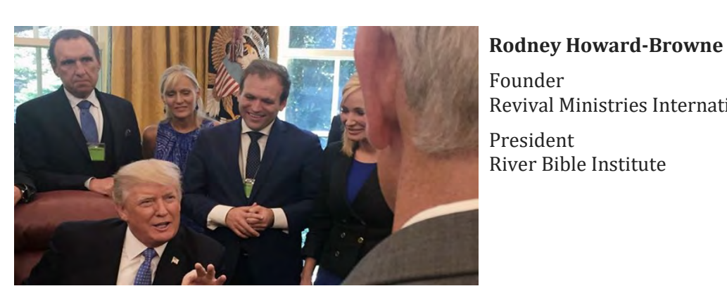
Founder Revival Ministries International President River Bible Institute