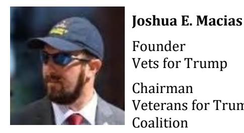
Founder Vets for Trump Chairman Veterans for Trump North-East Coalition